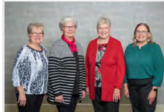
SPECIAL MINISTRIES COMMITTEE